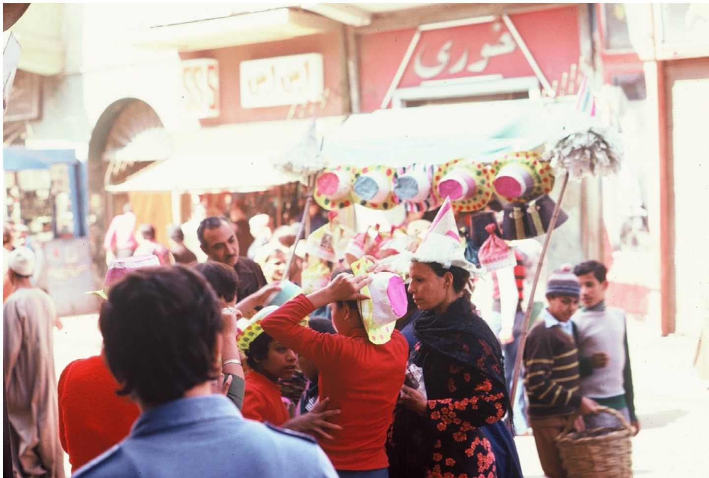
Women trying on hats

One finds along the road things that we would associate with amusement parks, rides, sideshows, etc. These women are trying on what appear to be party hats.