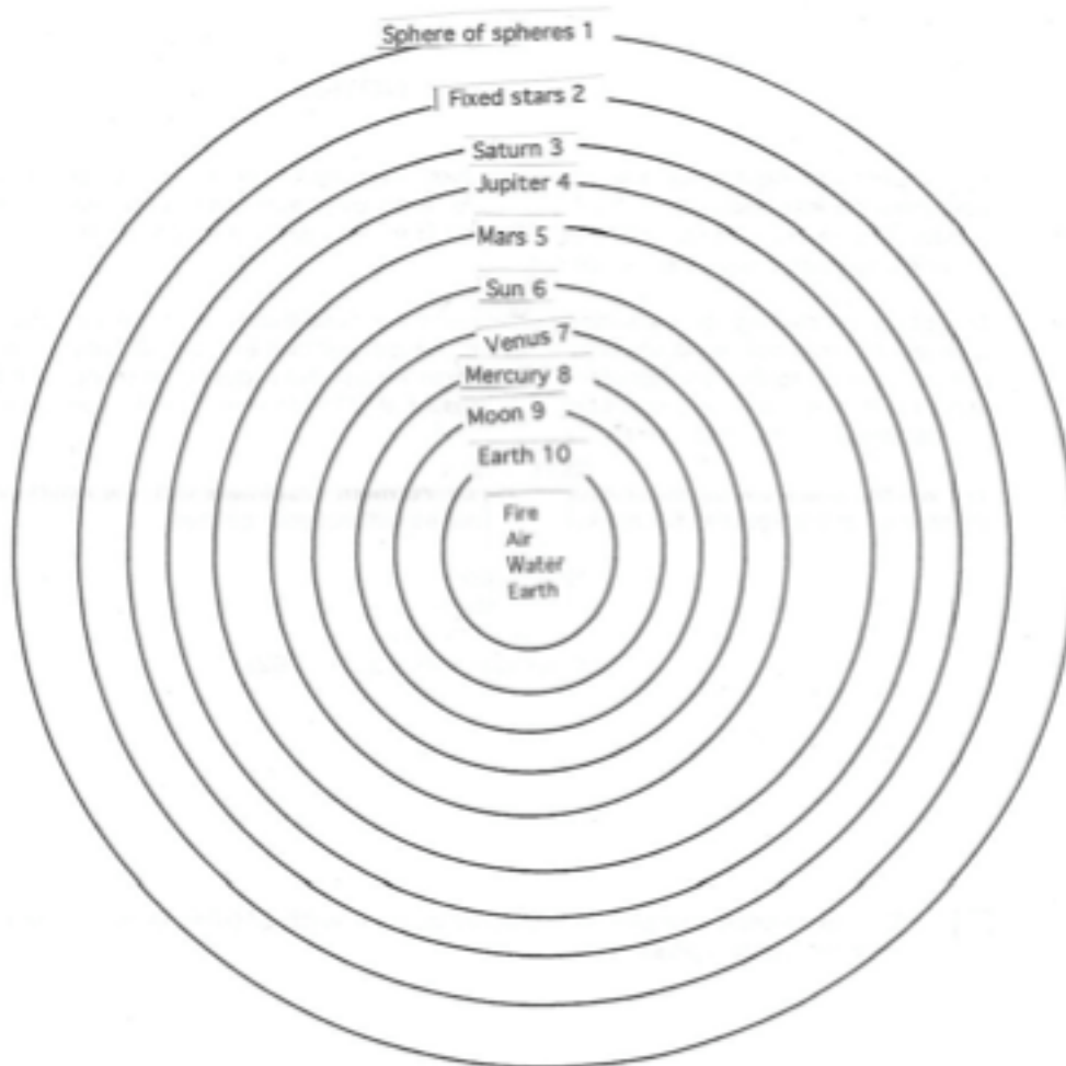
Ptolemy's "rotten apple" universe

First three intelligences and emanations from them: