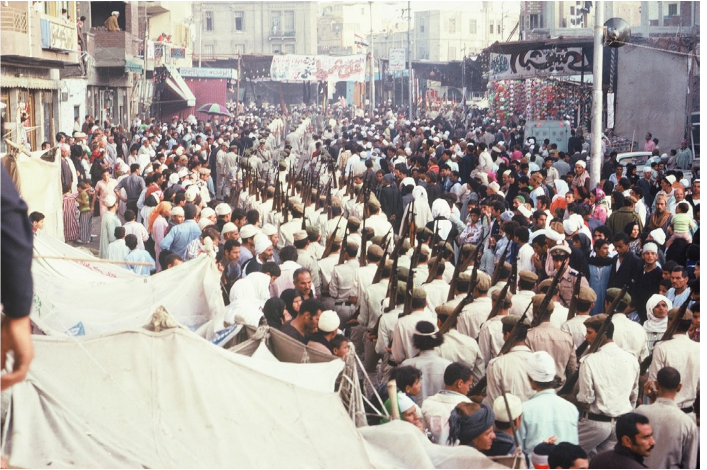
Troops in procession

Soldiers marching at the beginning of the procession on Thursday. They are present to keep order, to make the government's presence visible and to show the government's support for the maulid .