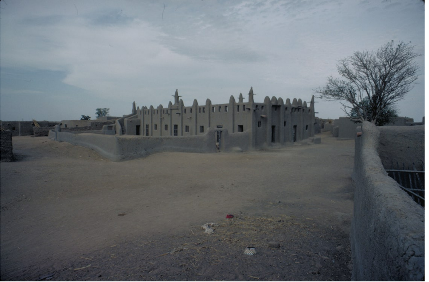
Another view of the mud built mosques at Pondo, Niger (1990), cf. Figure 14.10 in Islam – The eBook .