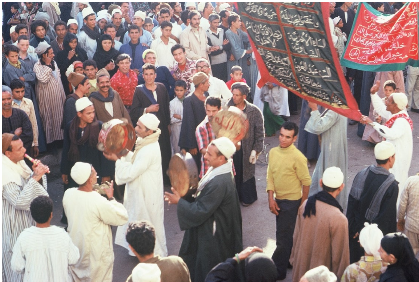
Tambourines and nay (flute) in parade.

Part of the procession on Thursday. As one can see, it was neither a silent nor a solemn affair. This is also Fig. 12.3 in Islam-the eBook .