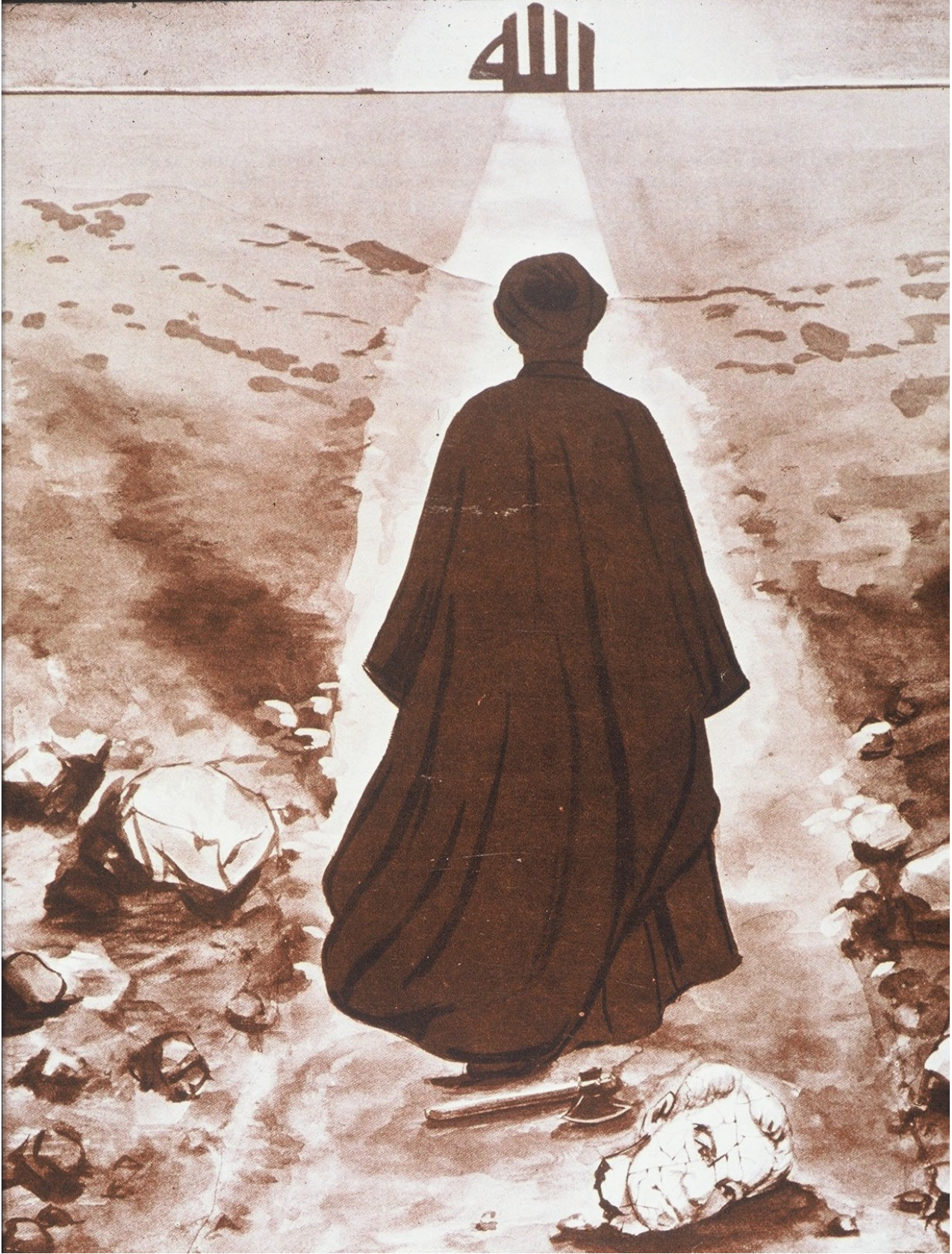
Cover of a pro-Revolution magazine depicts Khomeini in the role of the prophet Ibrahim, who broke his father's idols (Qur'an 21:58)