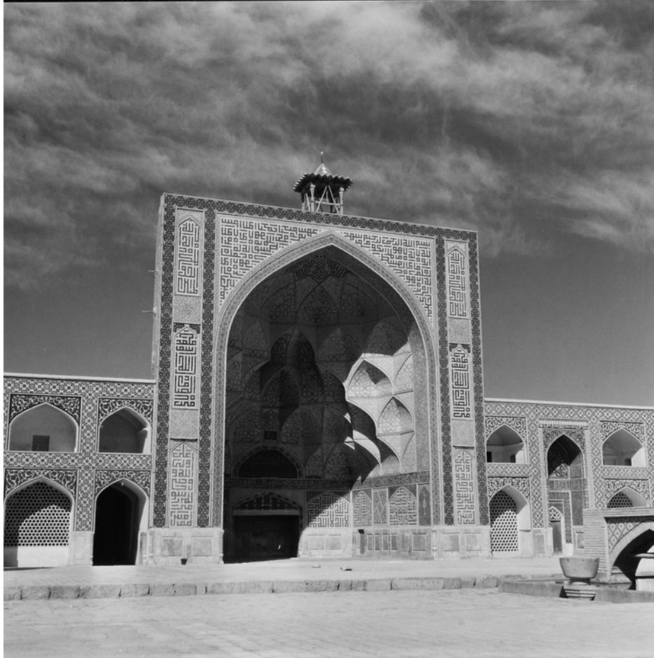
Northwest iwan (arch) of the Masjid-i Jami (Friday Mosque) in Isfahan, built about 1121 and redecorated in 1700-1. The mosque, typical of Iran, has four iwans in the walls that surround an open courtyard, one on each side. Architecturally the iwan has its historical roots in the Sasanian period.