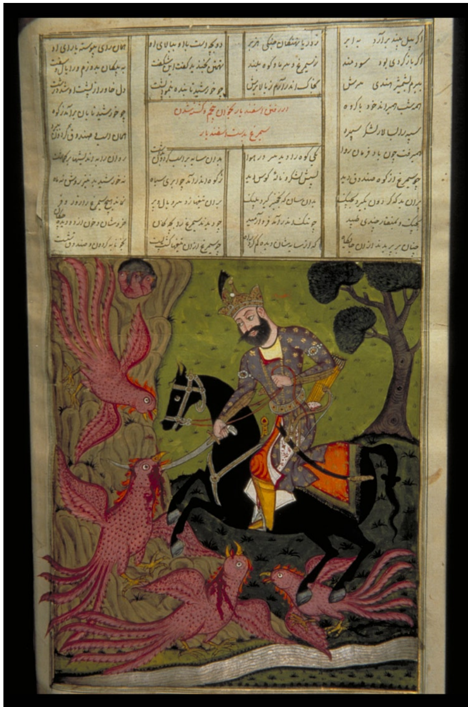
From a Mughal copy of Firdowsi's Shahnameh (Book of Kings). The figure depicted is Prince Esfandiar, son of King Gushtasp (Vishtaspa), the convert and protector of Zarathushtra. The prince fought in the cause of Zarathushtra, and accomplished a number of heroic exploits but was finally killed in combat with the great hero, Rustom.