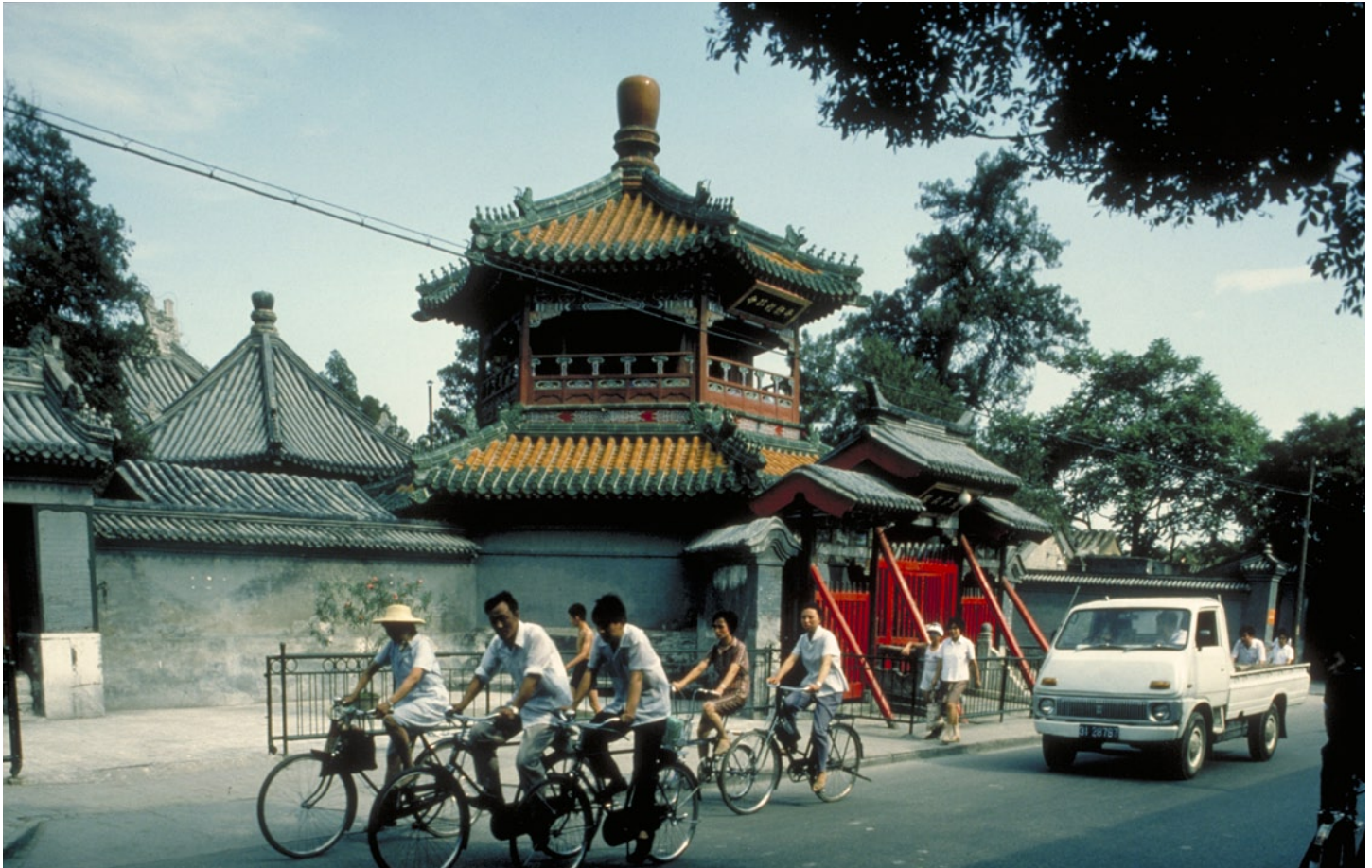
Entry to mosque in Beijing, China (1985).