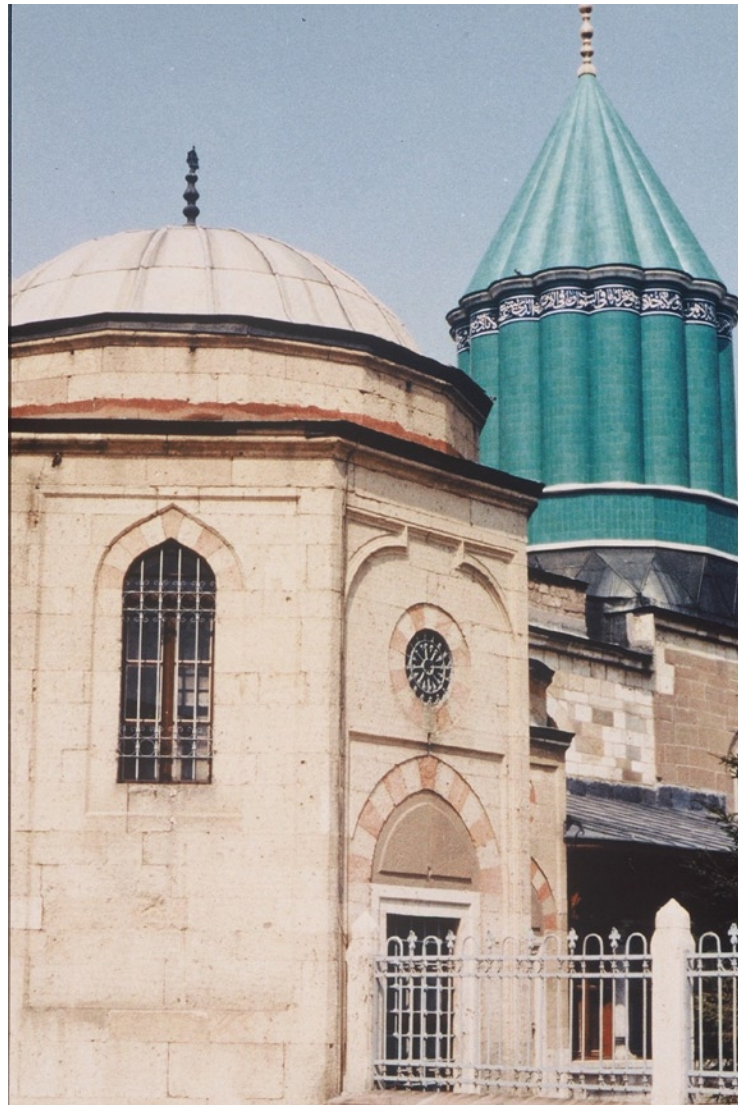
Rumi's mausoleum in Konya, 1991

but his poetry spread far beyond that, particularly to the Iranian and Indian worlds. It was officially closed in Turkey in 1925 but in practice continued and eventually was allowed to present dhikrs publicly once a year. Since the 1970s dhikrs have been performed on tour in Western countries. Rumi's mausoleum was officially converted into a museum in 1927 but the state can hardly control what goes on in minds of visitors.