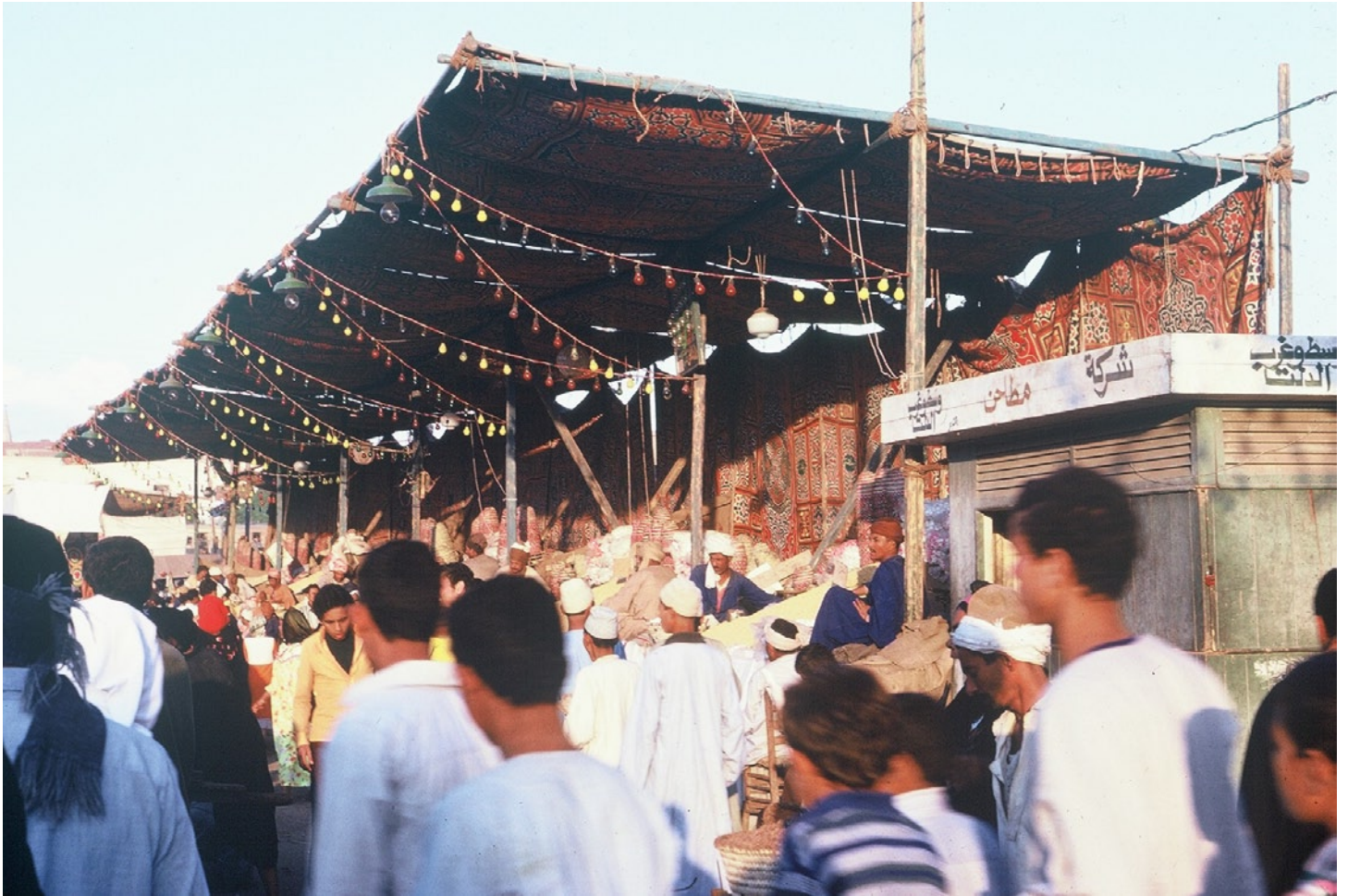
Stalls selling humus.

The Tanta mulid has always been an agricultural fair. These stalls, located on the road between the Mulid field (above) and the town contain hummus (chickpeas or garbanzos). The hummus sold at the maulid is said to have baraka and people are expected to take some home with them.