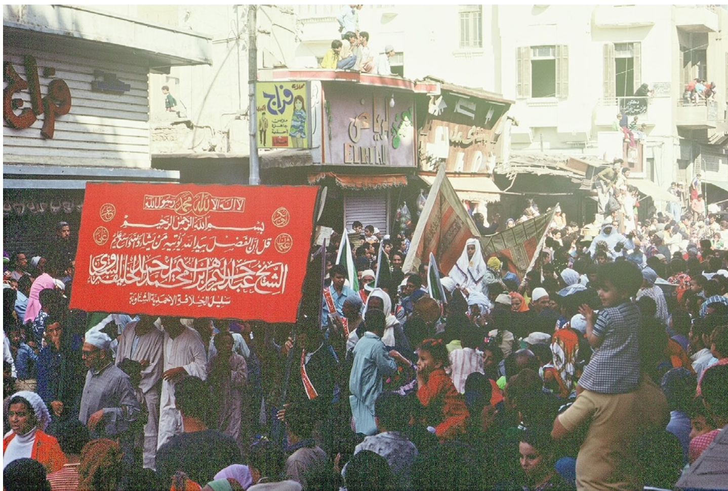
Procession the last day with the Khalifa of Sayyid Ahmad.

Procession on the last day, with the Khalifa of Sayyid Ahmad, the leader of the Ahmadiyya tariqa. According to Gilseman in 1964 the government soldiers upstaged the Khalifa, but this was not so in 1977. This is also Fig. 12.4 in Islam-the eBook .